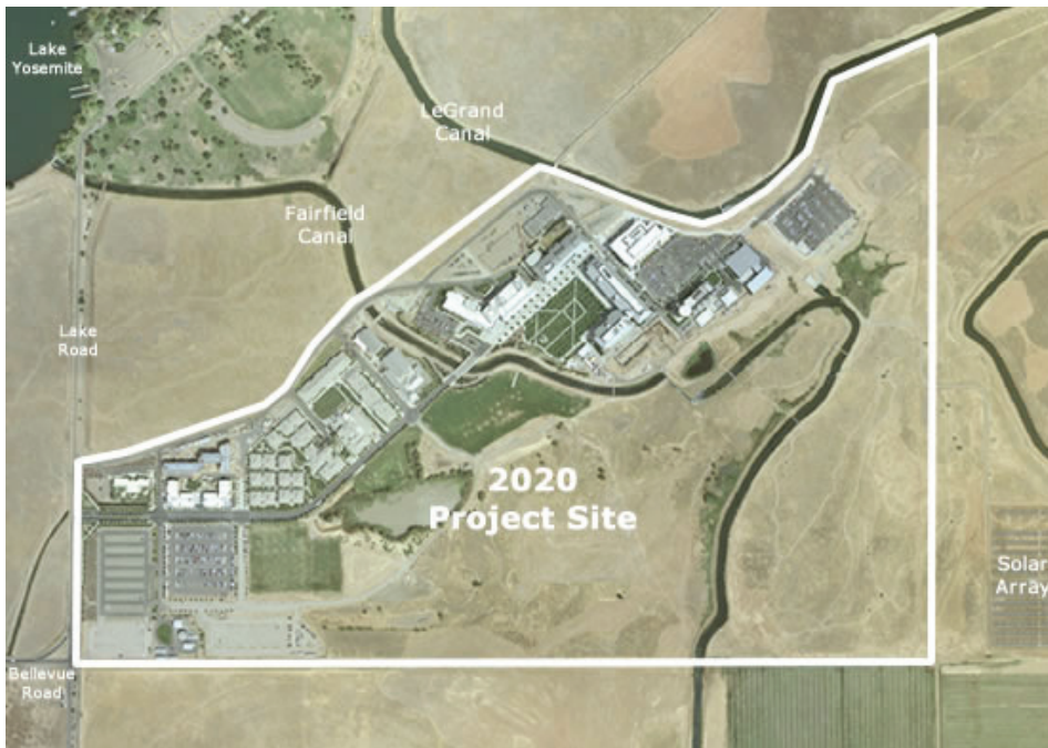
The UC Merced 2020 project will be built on the 219-acre campus site.